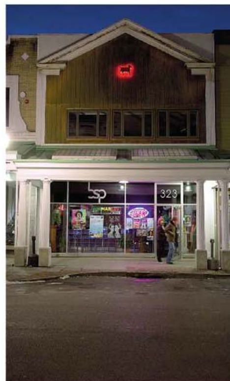
From the street, BSP looks deceptively small; the entertainment complex actually contains 21,000 square feet.

Bank of America Woodstock Inn on the Mill Stream Catskill Mtn. Pizza Co. Dharmaware Inc. Empty Spaces Gypsy Wolf Cantina Joshua's Café Marie's Bazaar Mirabal of Woodstock New World Home Cooking Rite Aid Bradley Meadows Plaza River Rock Health Spa The Grove Shop The Red Onion Sunflower Natural Foods Candlestock Free Style Realty Westwood Metes & Bounds Realty Woodstock Music Shop