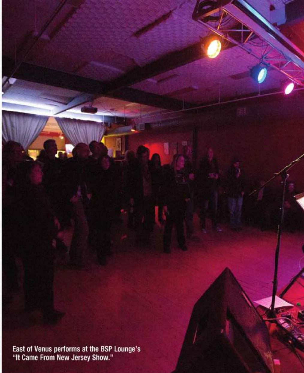
East of Venus performs at the BSP Lounge's "It Came From New Jersey Show."

April-August: Battle of the Bands. $5 Wednesday mini-battles, $5 Aug. 16 main event. $10 advance ticket for all shows.